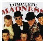
Our House by Madness