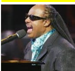
Happy Birthday by Stevie Wonder