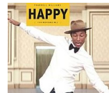
Happy by Pharrell Williams