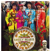
When I'm Sixty Four by The Beatles