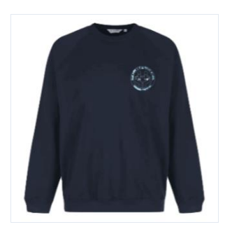
E9.99 (Reception only)