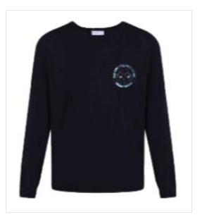
BLUE COAT INFANT V-NECK (KS1) £16.99

19 Park Place Shopping Centre Park Street Walsall West Midlands WS1 1NP