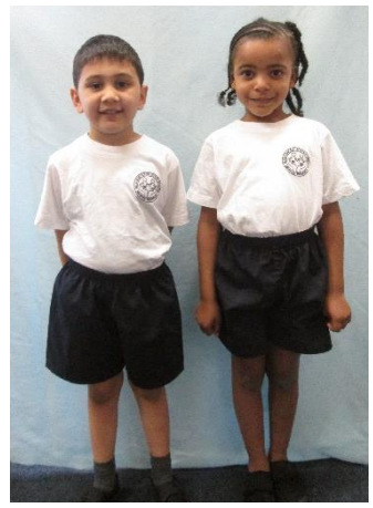
The Blue Coat C.E Federation